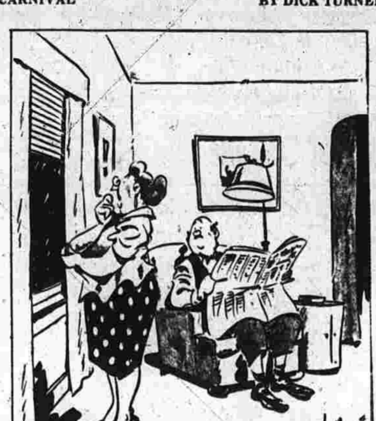
ALfred! Who do we know that's stupid enough to come over on a rainy night like this just to play bridge?"

Sense and Nonsense Lawyer—Since you're a witness in this divorce case I'll have to ask you some questions. Were you present when the trouble first started between Mr. and Mrs. Simpson? Witness—Sure, I was present at their wedding.