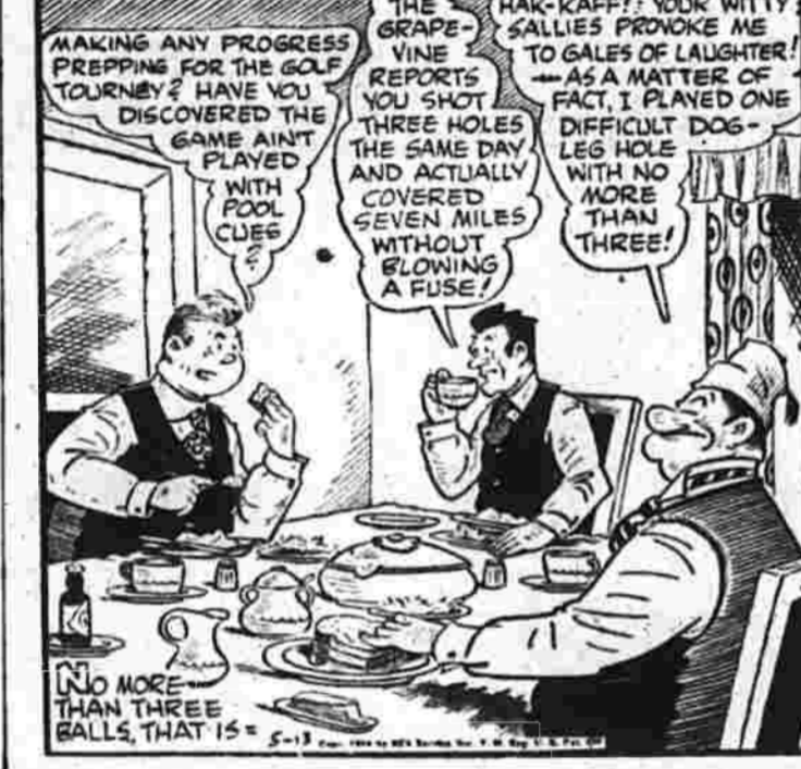
SWEETIE PIE BY NADINE SELTZER